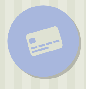
Ask you to fund your account with a credit card or other online payment method